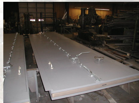
Oversized Acoustical Doors