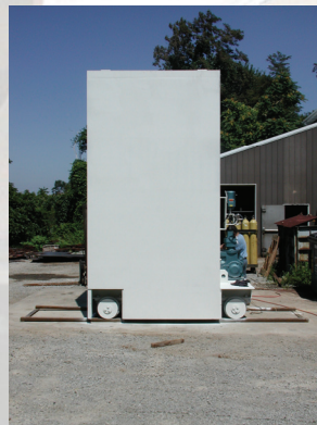
Radiation Shielding Plug Door Made for Overly Door MFG