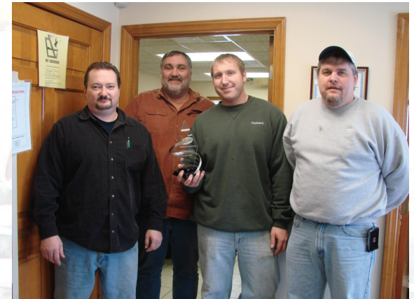
In 2009 WSF Received an Achievement Award from GE Hitachi Nuclear Services