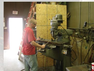
Bridgeport Milling Machine