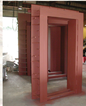
Blast Door Frame Made for Overly Door MFG