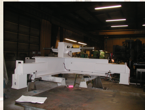
Nuclear Steam Dyer Strongback