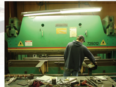
250 ton Accurpress Press Brake