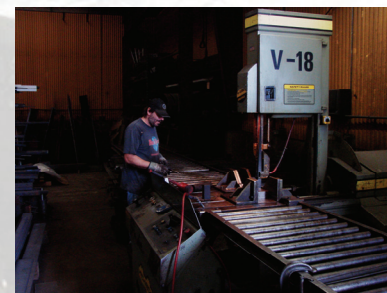
Hydmech V-18 Vertical Saw