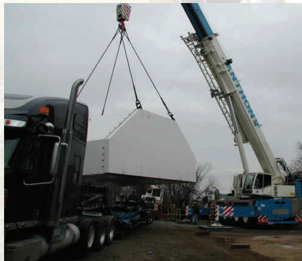
Nuclear Steam Dyer Shipping Container/ Cask For GE Hitachi Nuclear Services